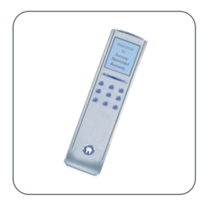
...or through the ArcRemote™ Universal remote control for wireless home devices