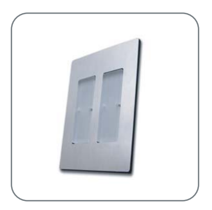
All ArcLight panels are networked by the ArcWay Home Device Gateway (Lutron® faceplate pictured. Others available.)