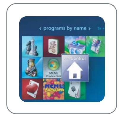
Control all home lighting from a central control panel on your PC using Windows Vista...