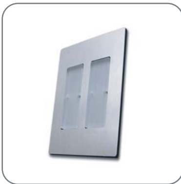
ZigBee compliant devices are automatically controllable by the ArcRemote™...

(Lutron® faceplate pictured. Others available.)