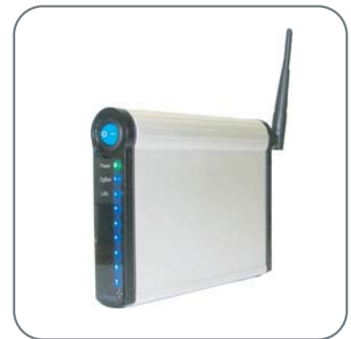
...using the ArcWay™ Zigbee-Ethernet device gateway.