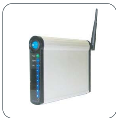
All ArcLight™ panels are networked by the ArcWay™ Home Device Gateway