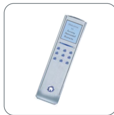
...or through the ArcRemote™ Universal remote control for wireless home devices