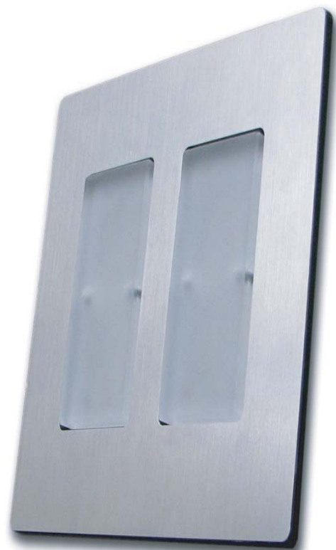
Lutron® faceplate pictured. Others available.

Wirelessly integrate and control your home lighting system. Manage it from your Windows Vista PC or ArcRemote universal remote control.